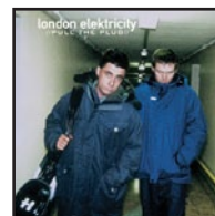
NHS12LP/CD/DD: Pull The Plug (1999)