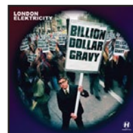
NHS56LP/CD/DD: Billion Dollar Gravy (2003)