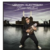
NHS95LP/CD/DD: Power Ballads (2005)